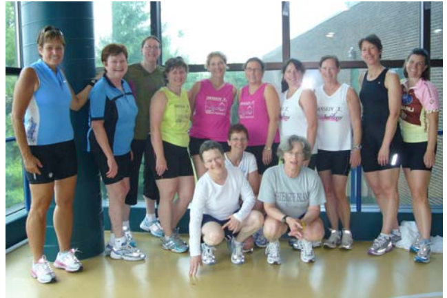
TSTS members take a break for a group picture on the track