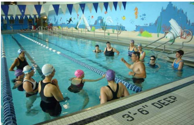
Reviewing efficient swim technique and practice with swimming drills